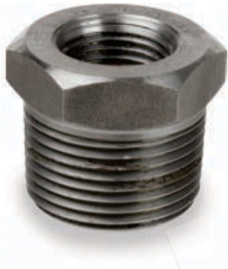
Fig. 42HB3 – Hex Bushing